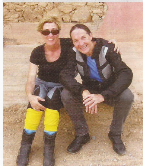
Moroccan Magic is one of the tours in the World On Wheels portfolio. Check out the website at www.WorldOnWheels.tours